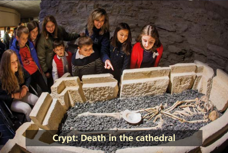
Crypt: Death in the cathedral