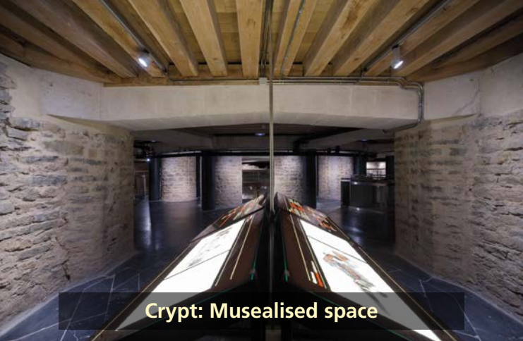
Crypt: Musealised space