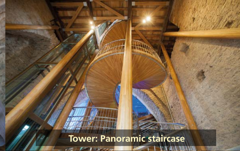
Tower: Panoramic staircase