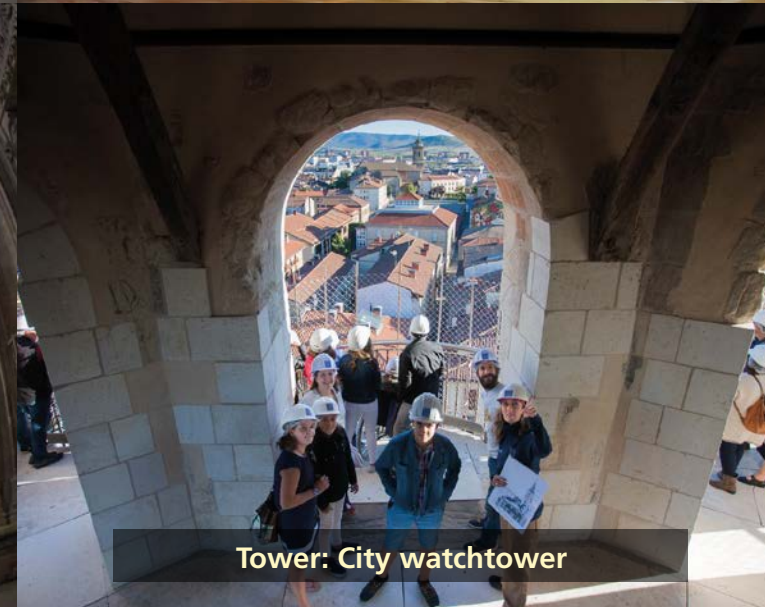
Tower: City watchtower