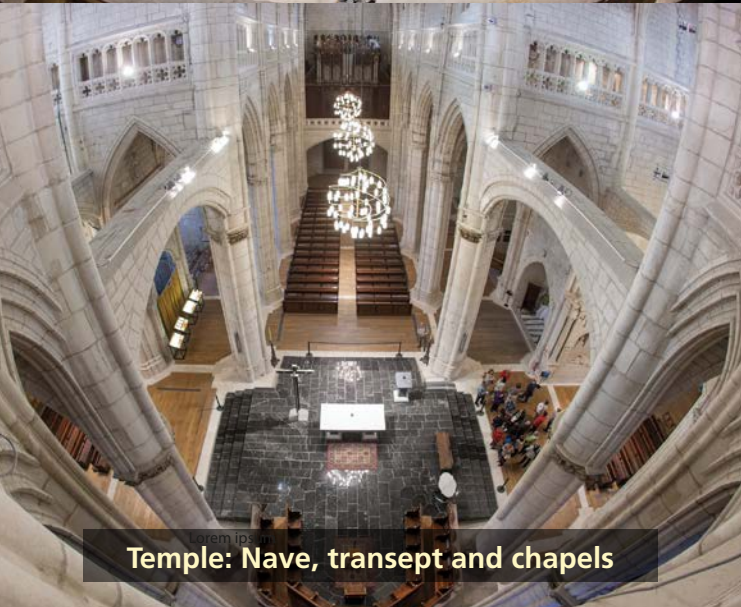
Temple: Nave, transept and chapels