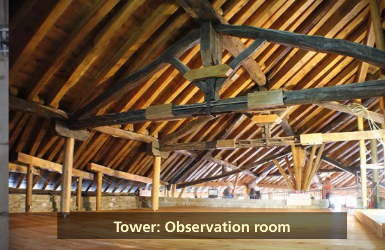
Tower: Observation room