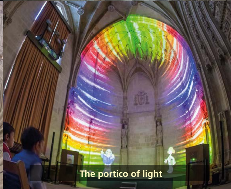
The portico of light